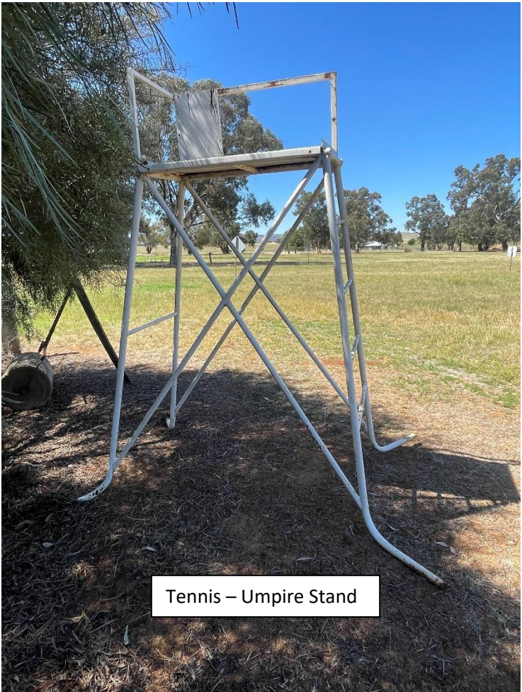
Tennis – Umpire Stand