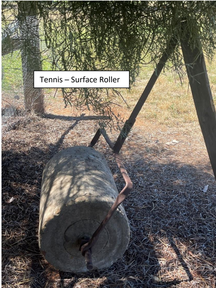
Tennis – Surface Roller