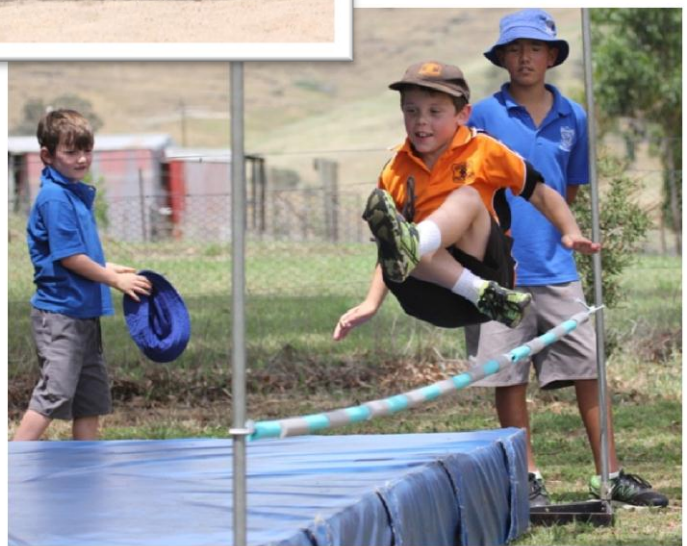
Images from Infants' athletics and Primary tabloid sports