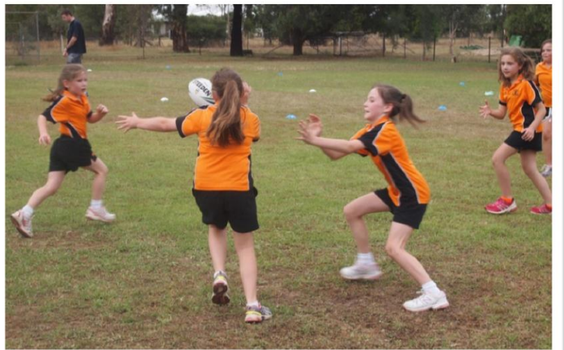
Images from Primary Rugby League Clinic